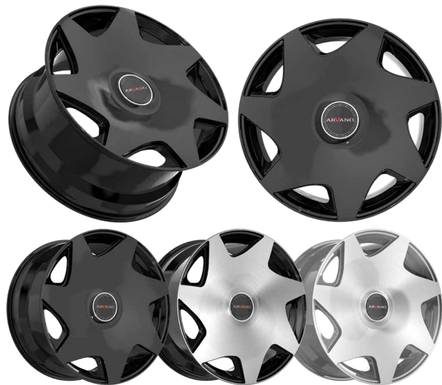
AXL - 4 OSLO