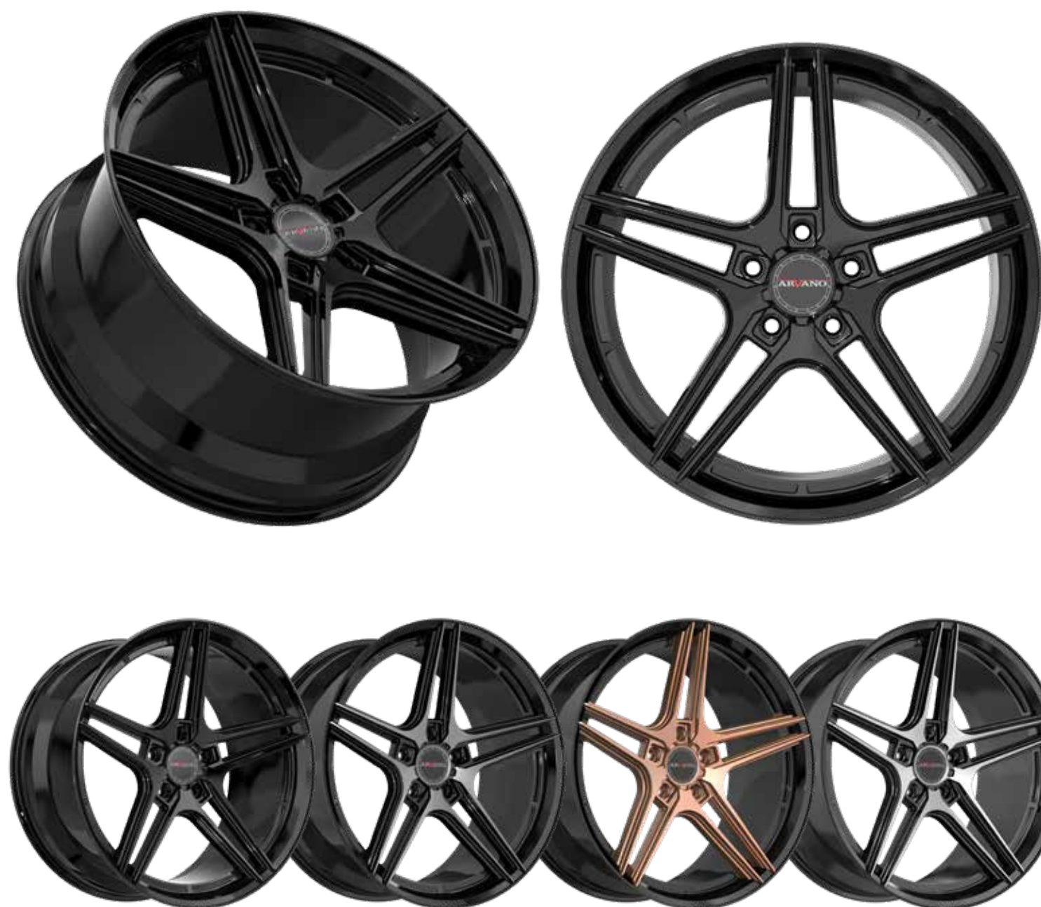
AV - 57 IBIZA