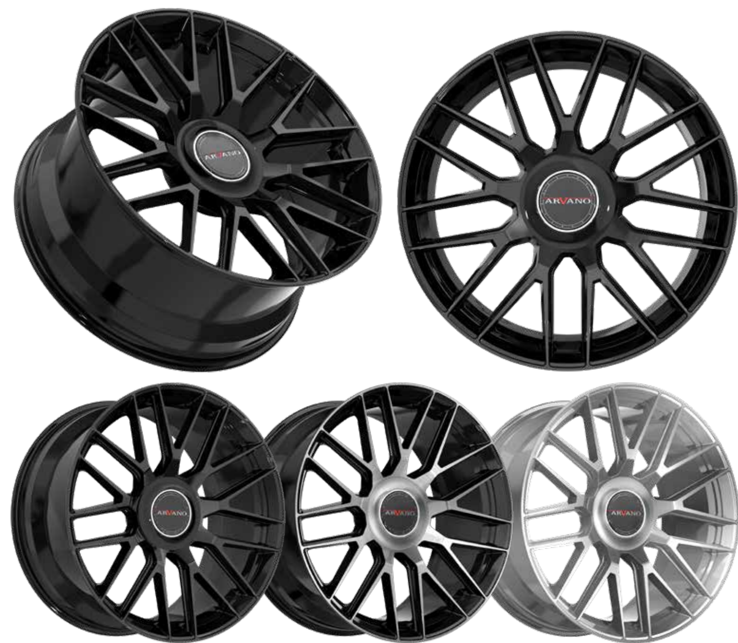
AXL - 1 ANDROS