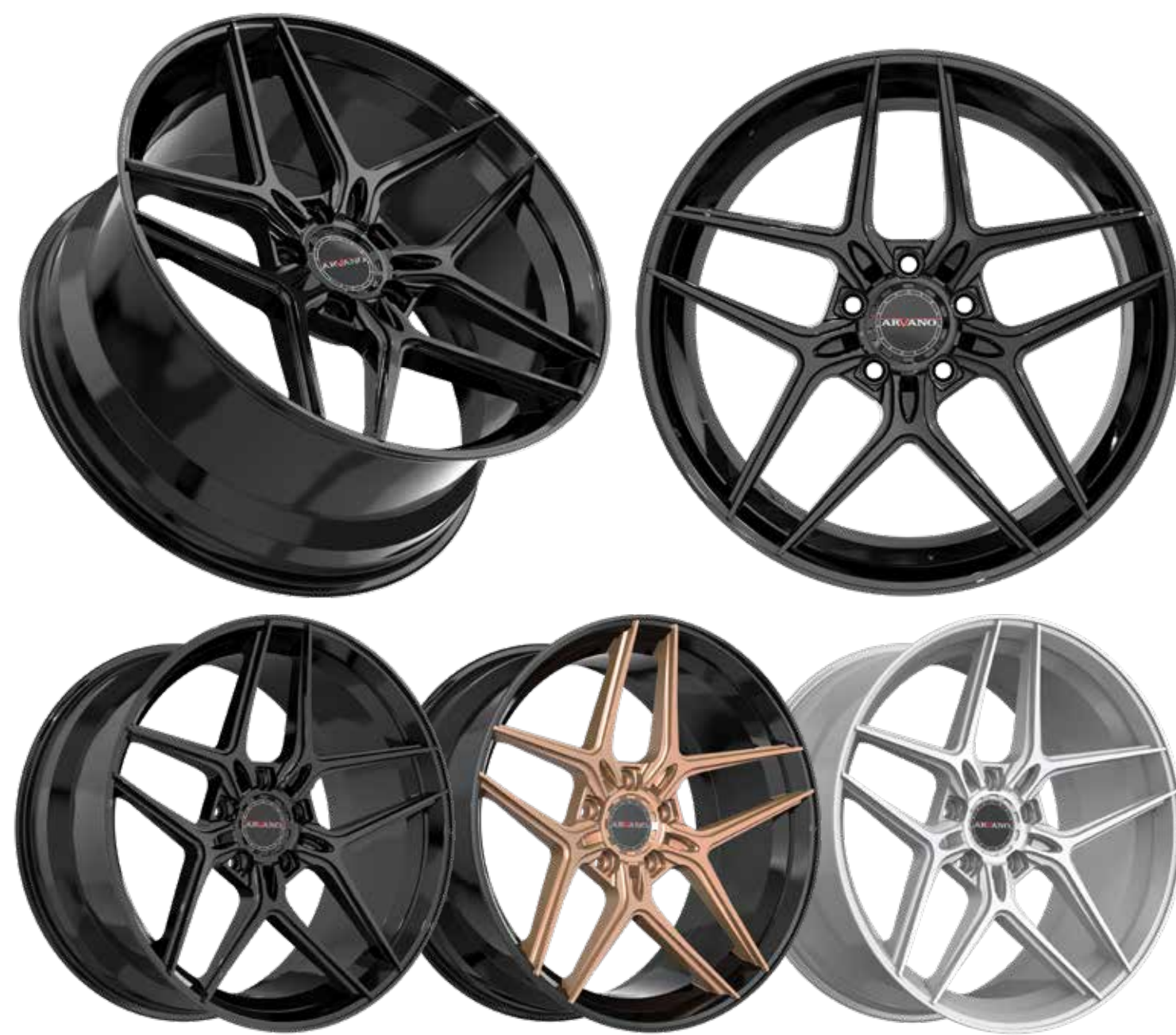
AV - 51 ATLAS