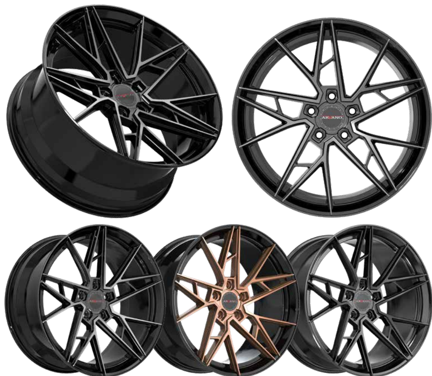
AV - 56 BARCELONA