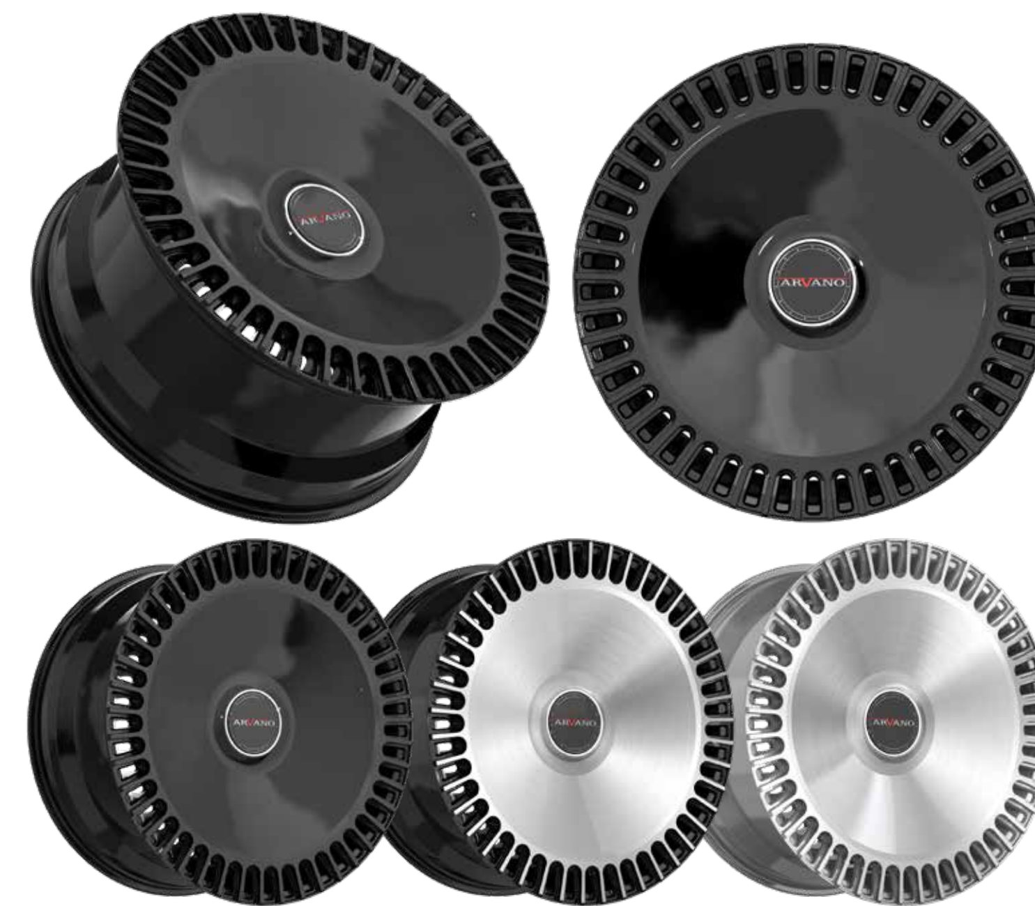
AXL - 6 LISBON