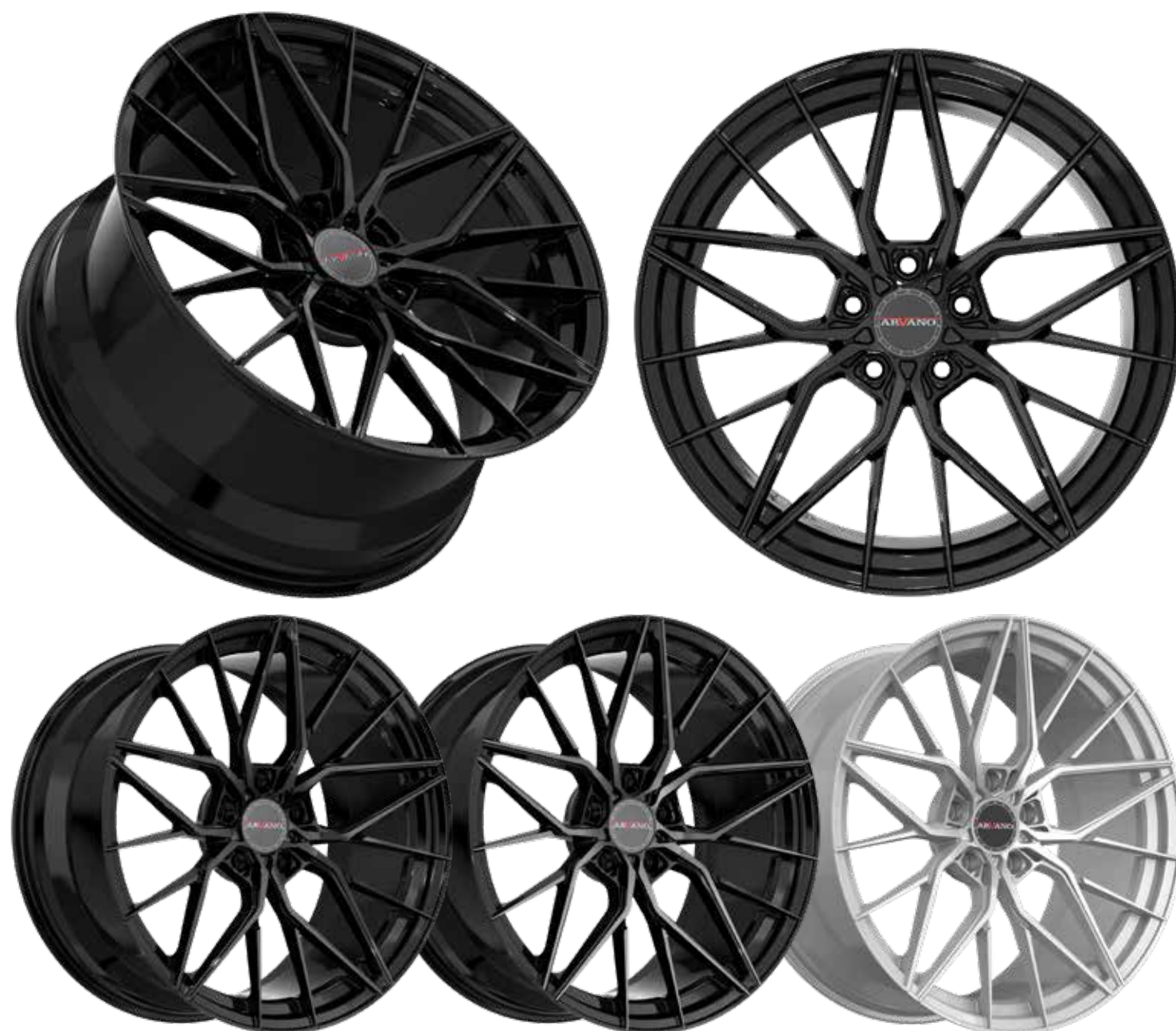
AV - 54 VALENCIA