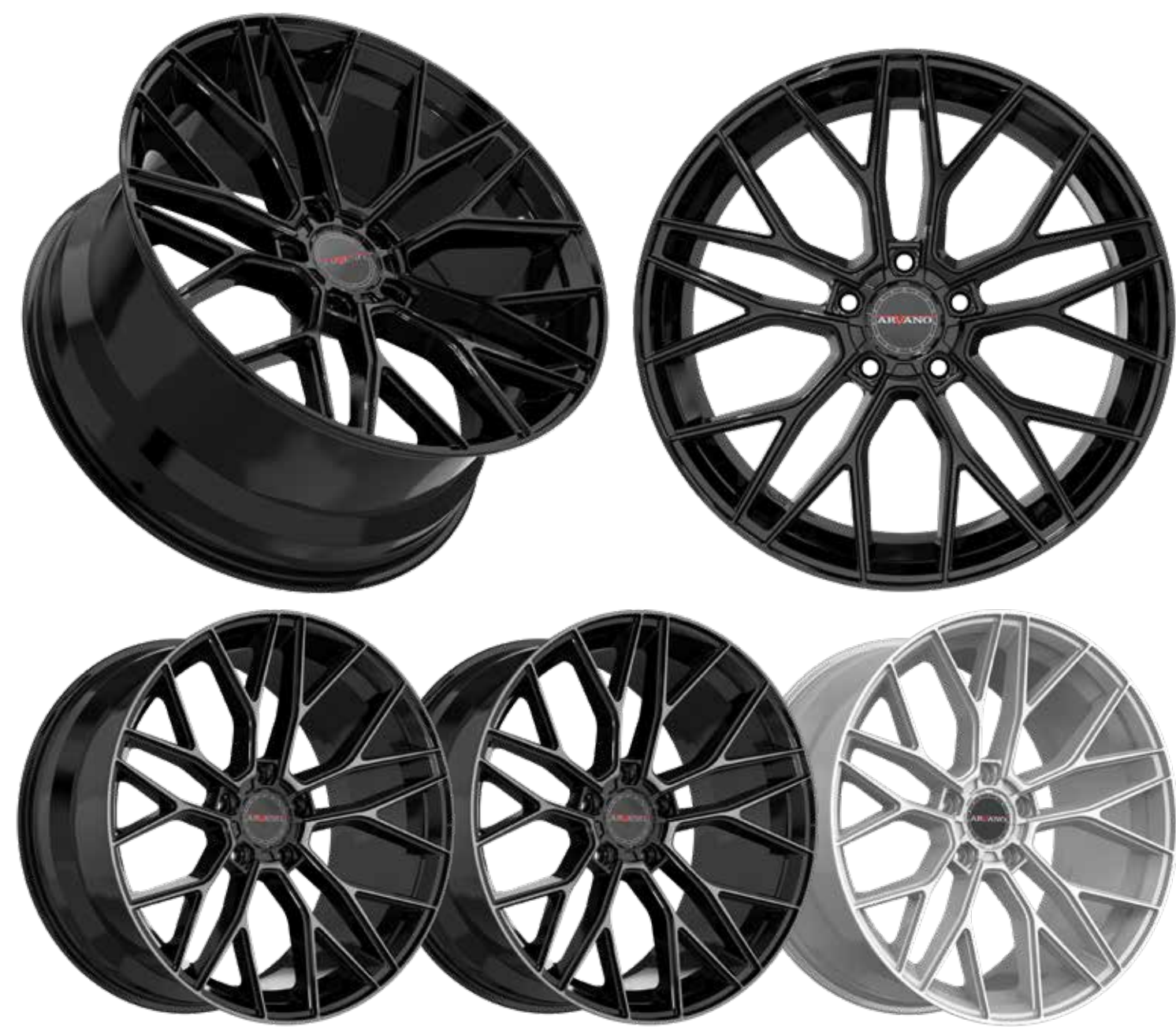
AV - 50 ACERIO