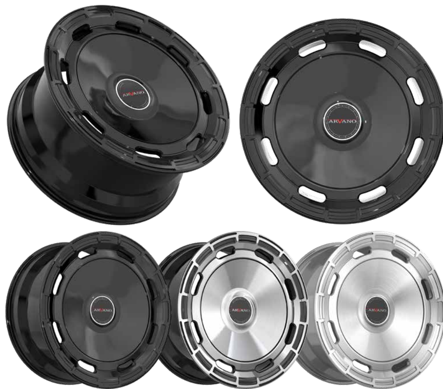
AXL - 5 ATHENS