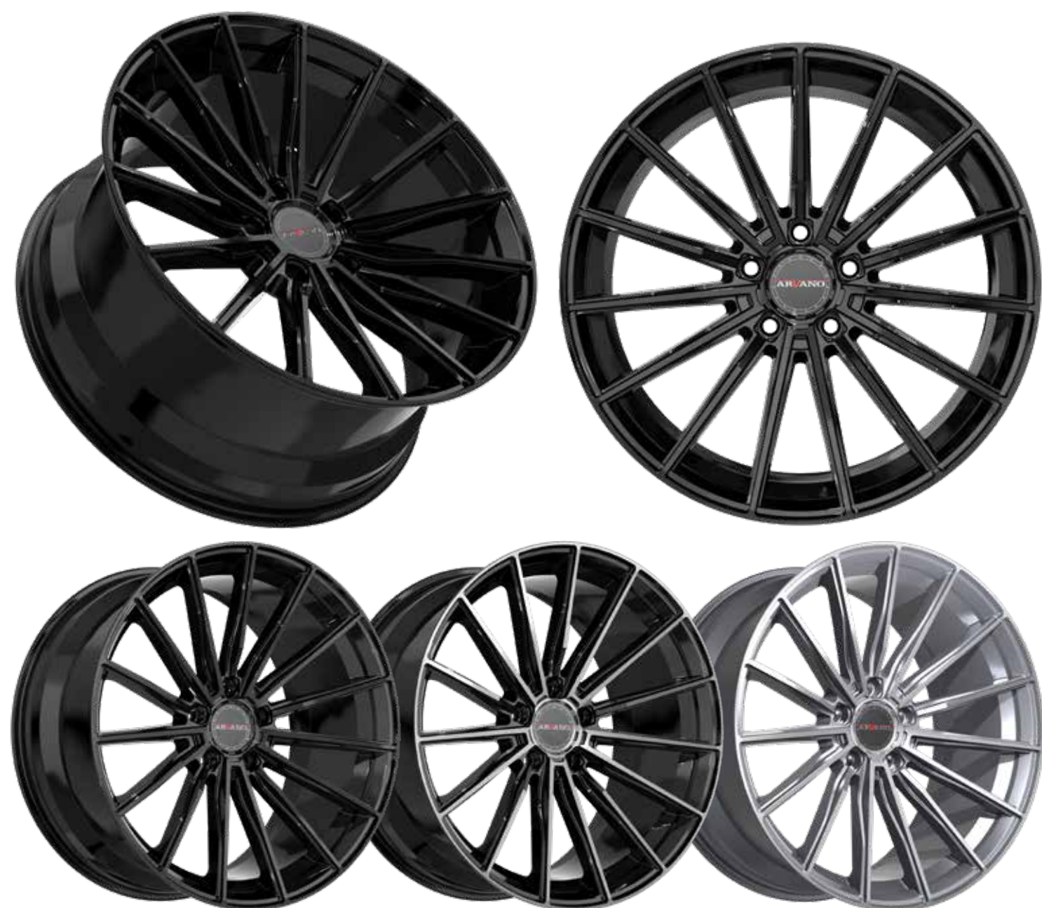
AV - 53 MILAN