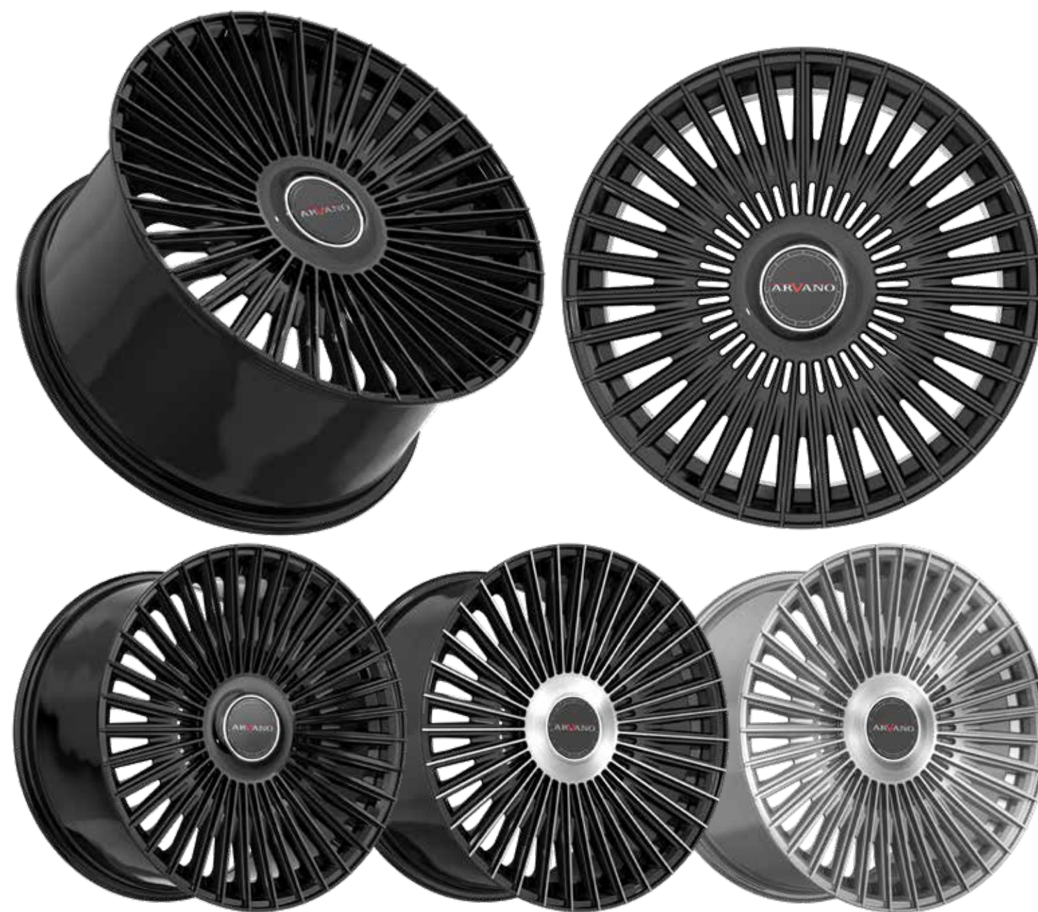
AXL - 2 SANTORINI