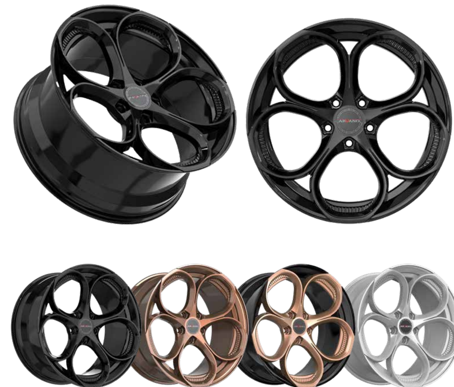
AV - 58 NAPLES