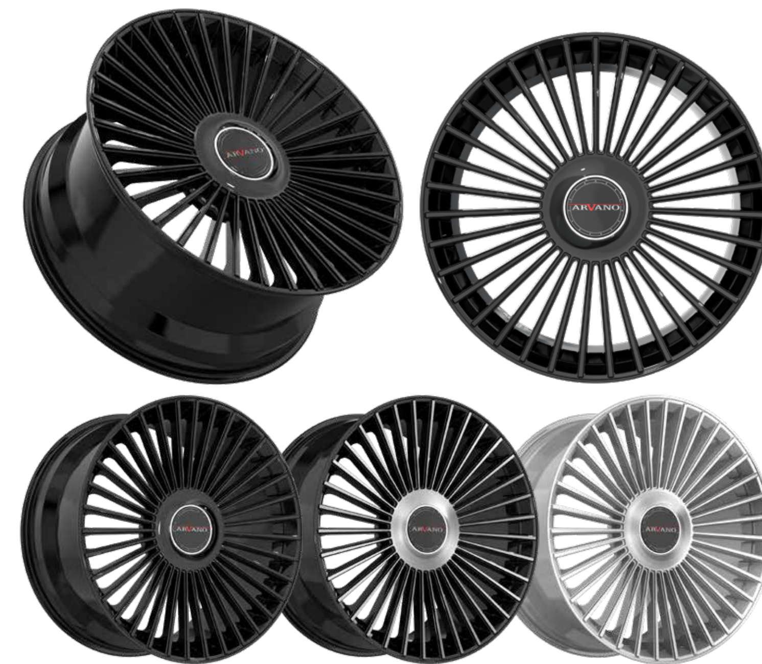
AXL - 3 PAROS