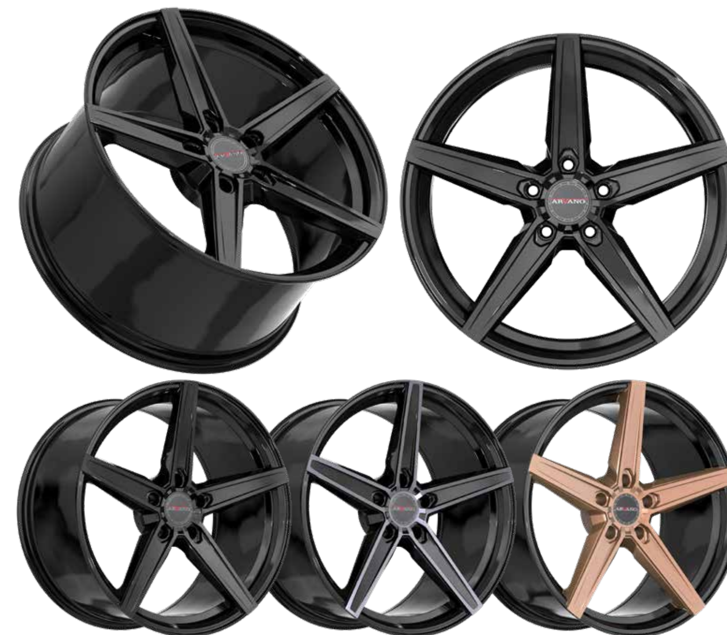
AV - 55 MADRID