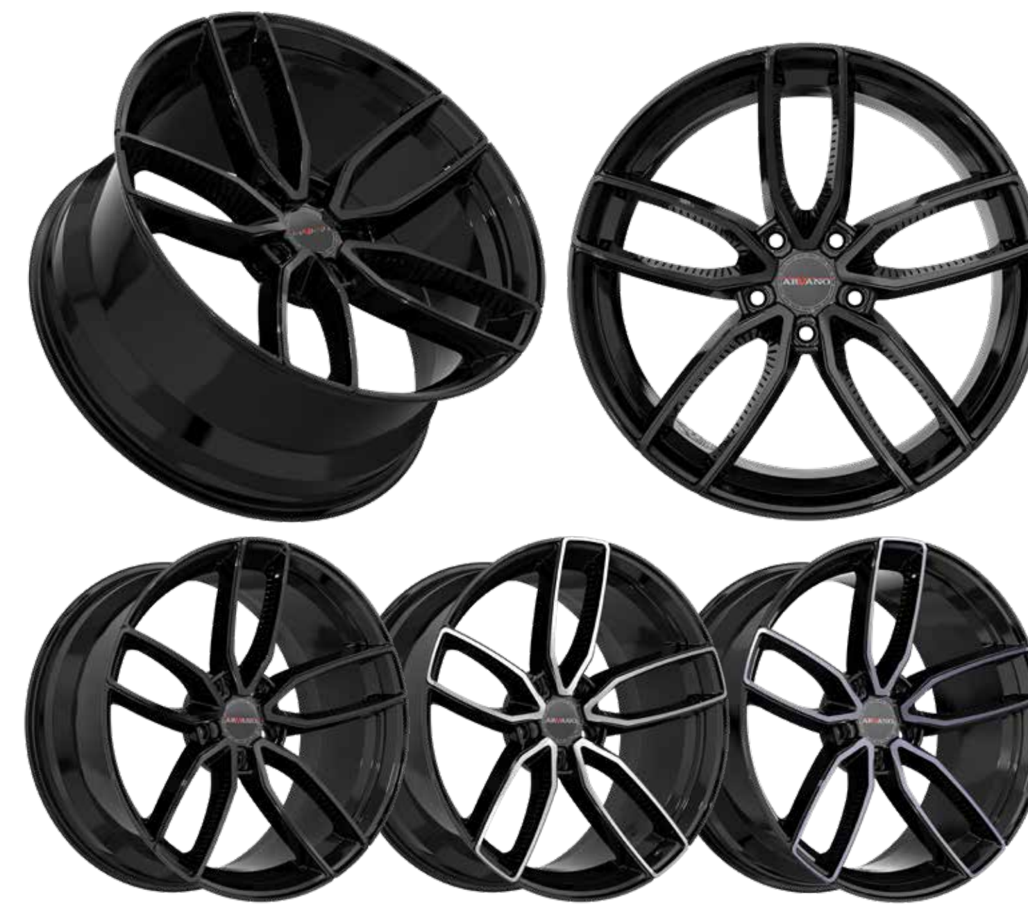
AV - 52 DUBAI